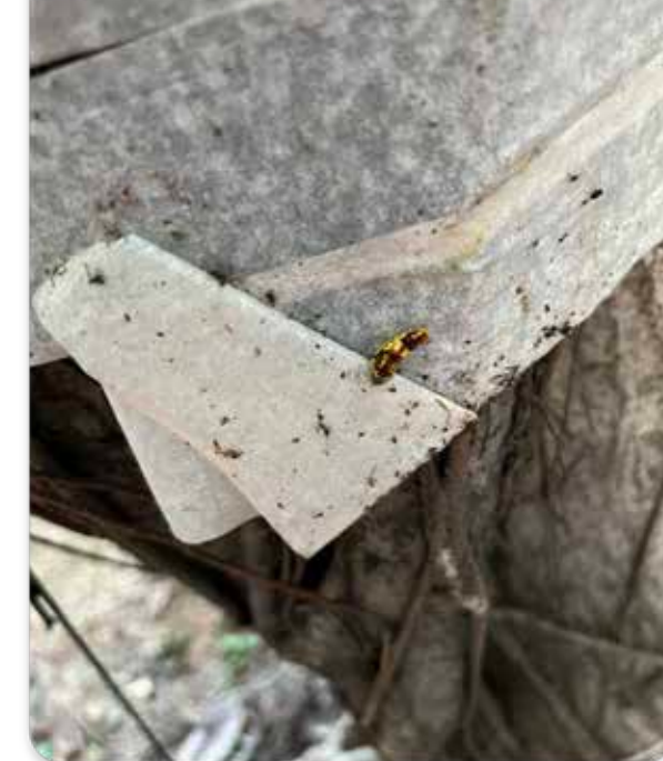
Figure 3. adhesive tape control method on banyan tree trunk