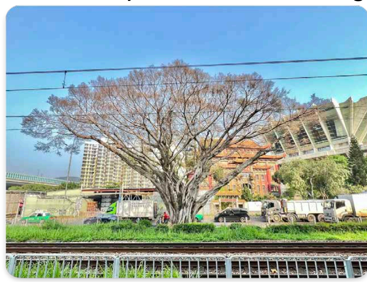
Figure 1. The whole banyan tree crowns were eaten away by Phauda flammans larvae