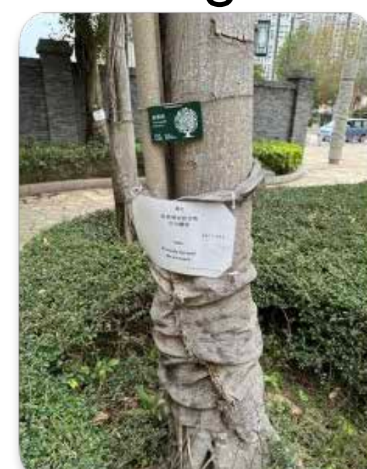
Figure 2. hemp mats control method on banyan tree trunk